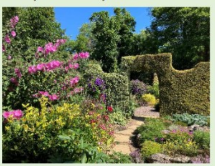
A town centre garden set in rooms, with a river terrace and attractive courtyard. Sorry – no dogs

In aid of The Friends of St. Lawrence's Church